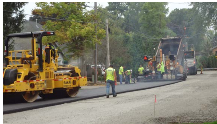
Road construction on South Park Avenue