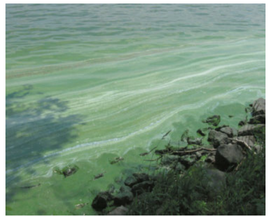
Blue-green algae fouls a shoreline.

When excess phosphorus enters an aquatic system, what often follows is more plant and algal growth than the system can handle. Large, dense populations of aquatic plants and algae can inhibit water recreation and shade out other important plants, reducing biodiversity. When these plant materials die later in the year, the decomposition process consumes dissolved oxygen which causes illness or death of fish and other aquatic animals. Algal blooms – specifically blue-green algae – can be hazardous to human health as well. Blue-green algae produce toxins that can cause illness in humans and pets when exposed through physical contact, ingestion, consumption of affected fish, and inhalation.